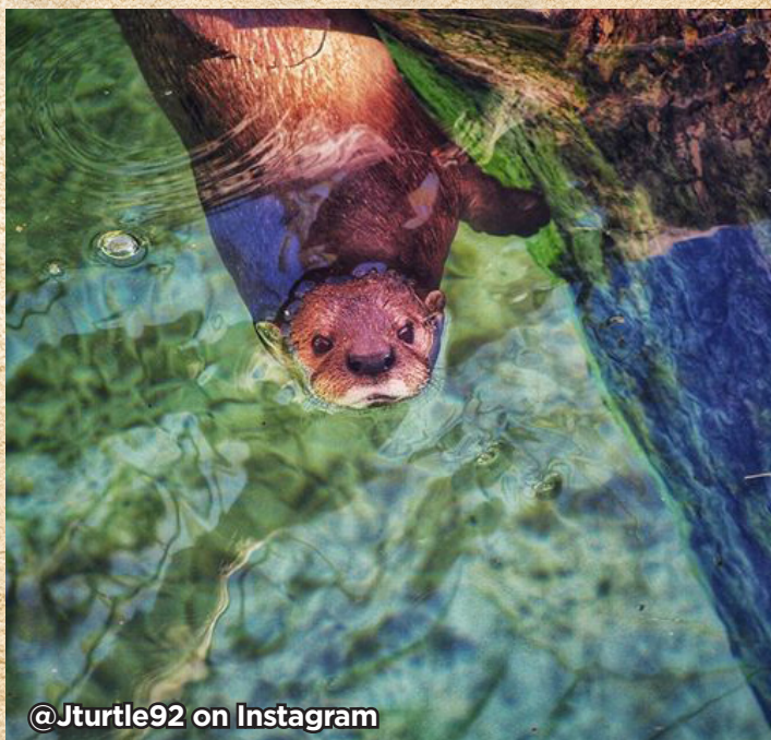
@Jturtle92 on Instagram