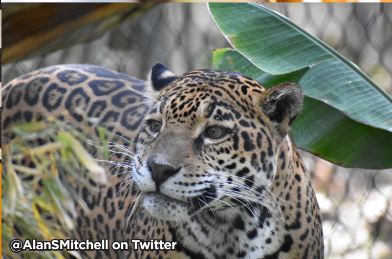
@AlanSMitchell on Twitter