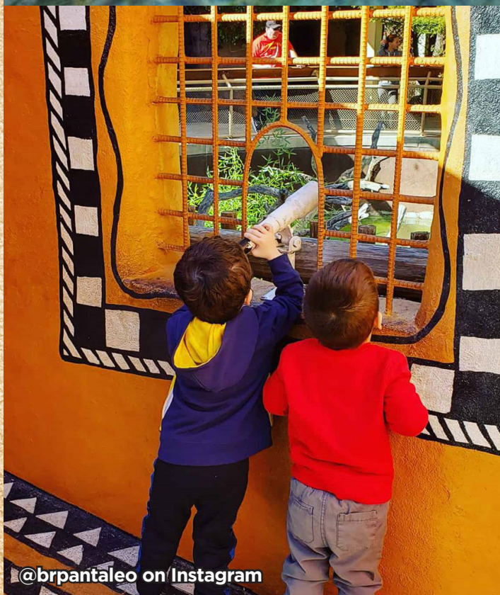
@brpantaleo on Instagram