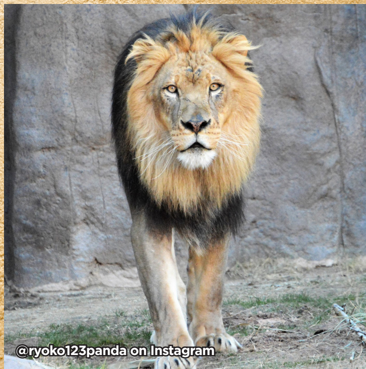
@ryoko123panda on Instagram