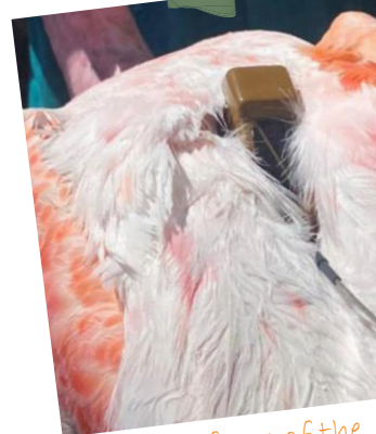
A close-up of one of the transmitters