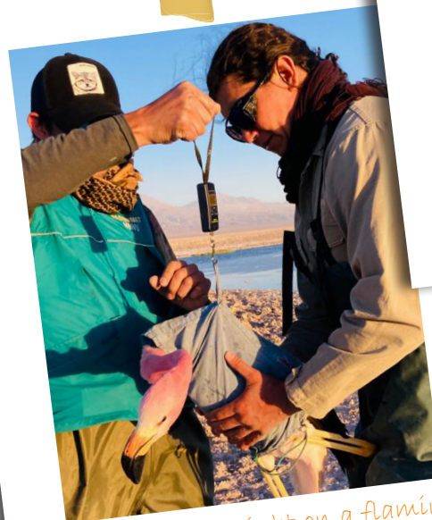
checking the weight on a flamingo