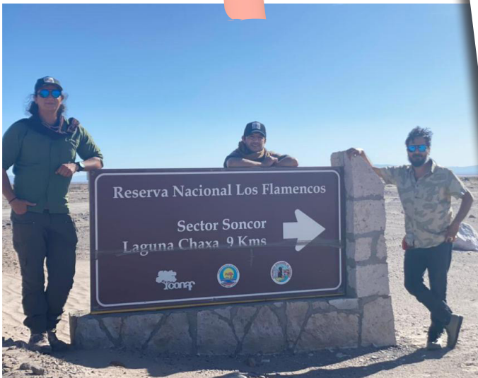
The team at Los Flamencos National Reserve

training workshops for tour operators and guides from this area in December. The workshops included information on the biology of the Andean Highland flamingos, information on how to watch them safely, and how to run an ecotourism business without disturbing or harming the flamingos. By completing these two major accomplishments this past year, the SAFE: Andean Highland Flamingo Program, led by the Reid Park Zoo and the Zoo Conservation Outreach Group, is on track to complete its program plan goals. Your continued support of Reid Park Zoo has led to this program's success!