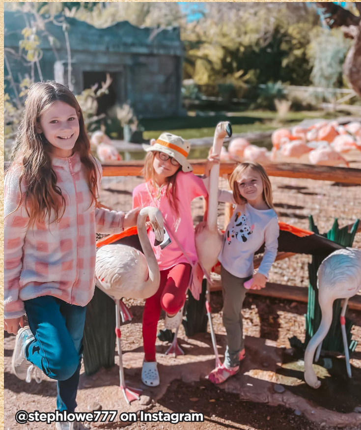
@stephlowe777 on Instagram