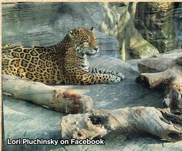
Lori Pluchinsky on Facebook