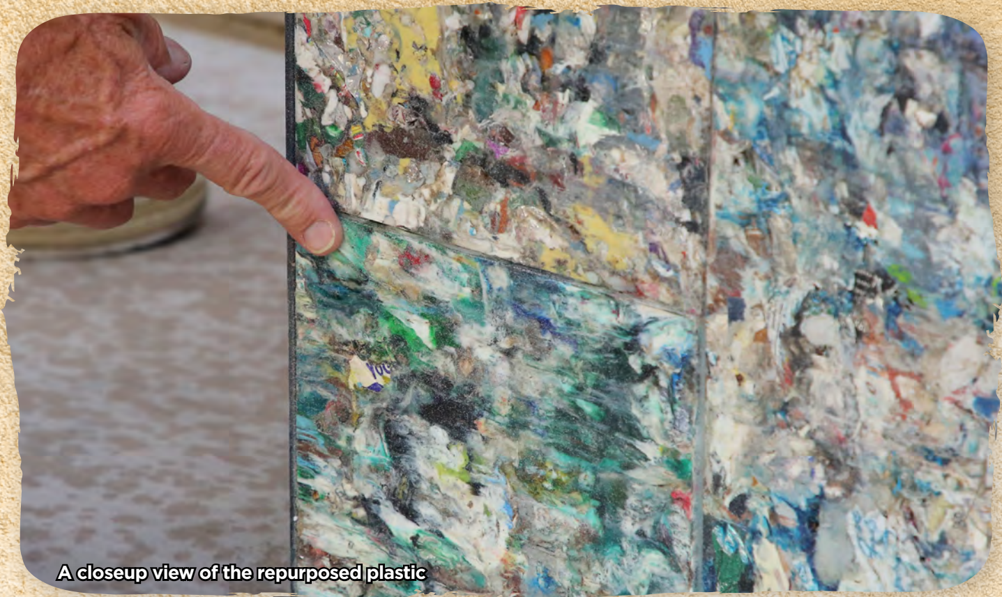
A closeup view of the repurposed plastic